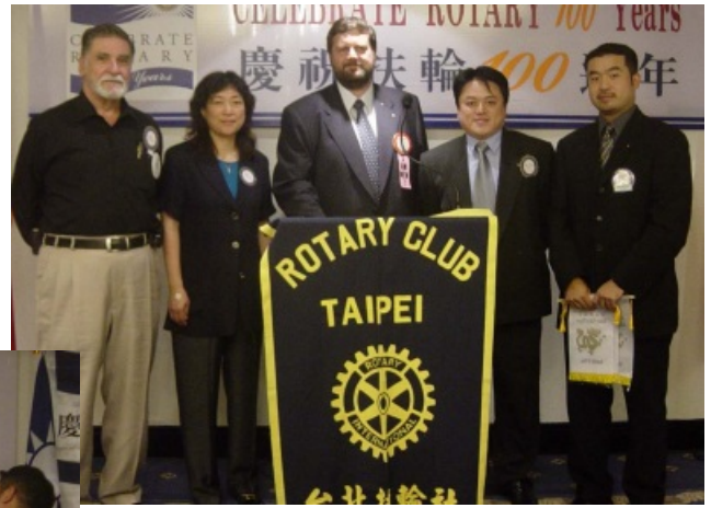
Welcoming Visiting Rotarians