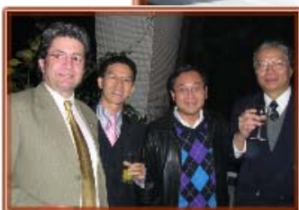
Good food, good wines, good company and a great host – this is our Rotary fellowship!